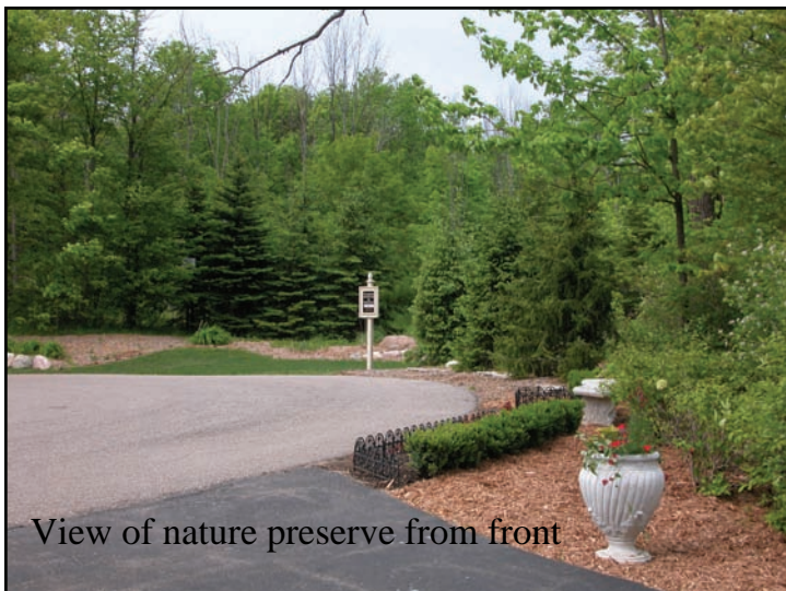
View of nature preserve from front