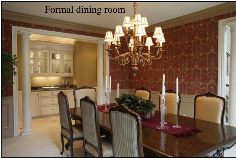
Formal dining room